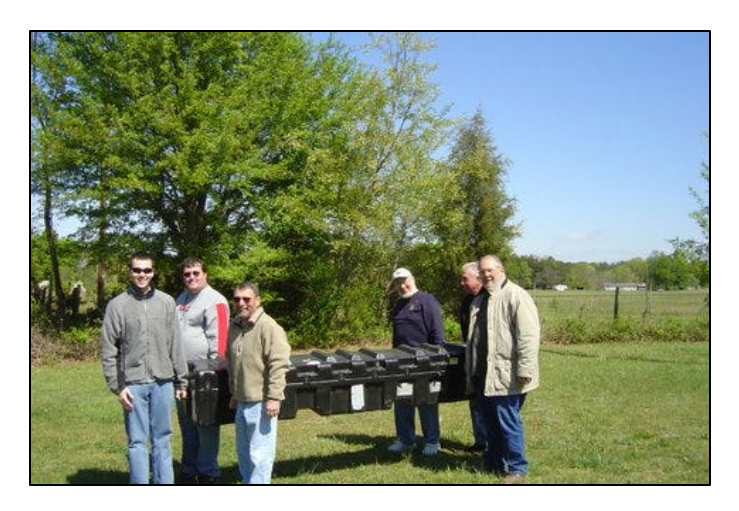
No, they aren't pallbearers. They're moving the shipping container that holds CDXA's portable, collapsible, 33-foot tower. This tower will hold the 20-meter monobander for the phone station.

To the right, clockwise from top left are glimpses of Ron's fine antenna farm. (Top left) A "fire tower" at 120 feet is convenient to work on all antennas, including H-double bays hung from the tower. (Top right) About 500 feet out this corridor is the terminating resistor for this excellent Beverage antenna. (Bottom) The "fire tower" and two other towers put a whole lot of radiating aluminum up where it can do the most good!